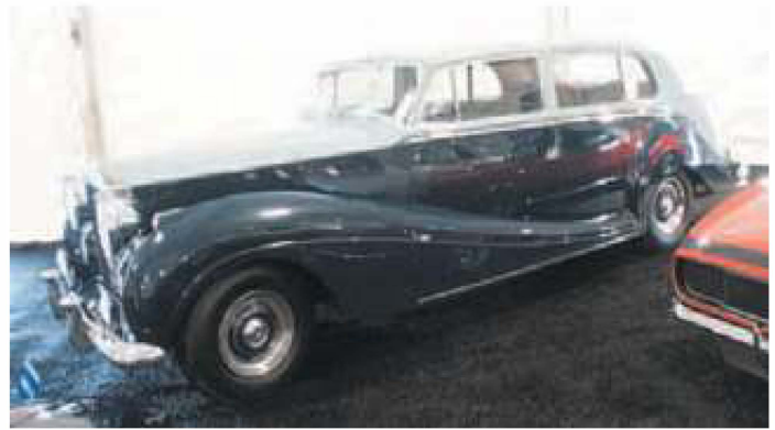
The Silver Wraith at Gooding (LDLW166).