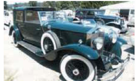
The Bonhams P II Newport (293AJS), sold at $126K.

Other than the newer cars, there were very few bargains among the cars sold. A nice looking Phantom II Gurney Nutting drophead (32PY) that sold two or three years ago at Christie's for about $100K brought $231K at Gooding this year. A Silver Wraith that sold at Bonhams two or three years ago for about $38K brought $50K this year, also at Gooding.