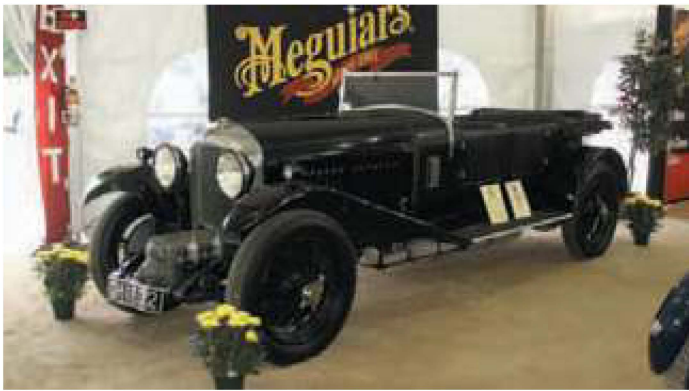
The superstar of the Blackhawk sale was this completely original Blower Bentley (SM3916). It was marked "price on application," which is shorthand for expensive.