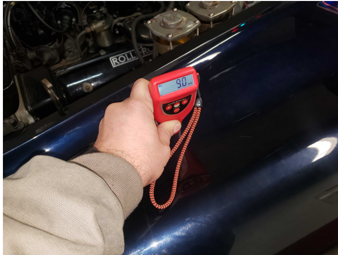
1964 Rolls-Royce Silver Cloud III