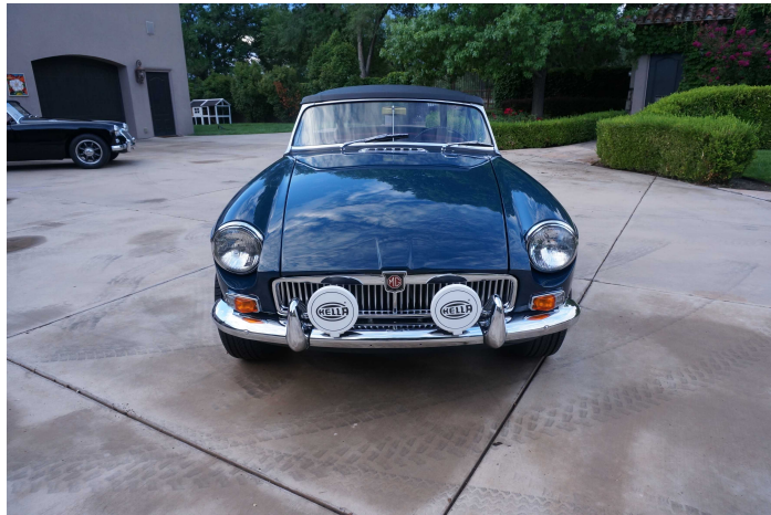
1967 MG MGB