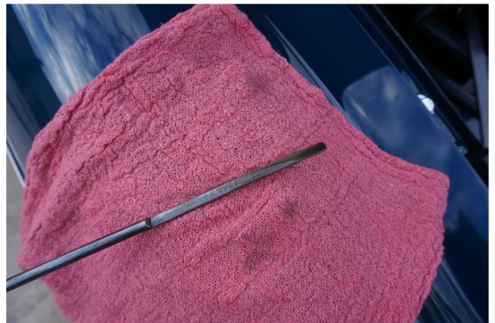
oil full and clean