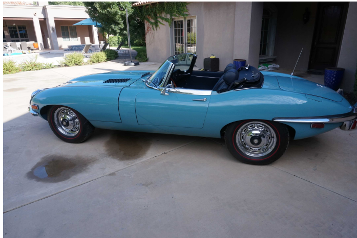
1969 Jaguar XKE