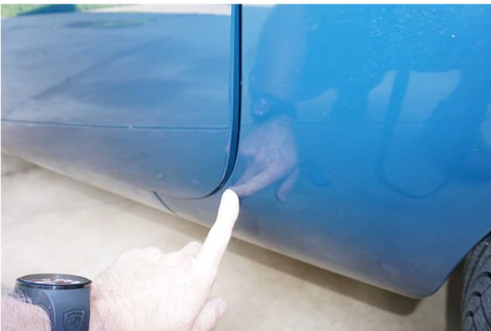
left door needs adjustment