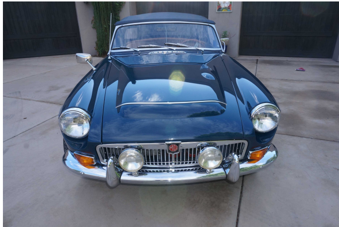
1969 MG MGC