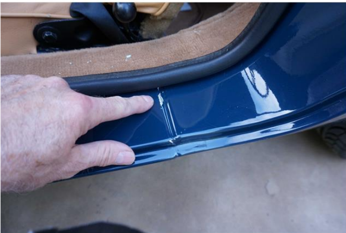
chip at sill