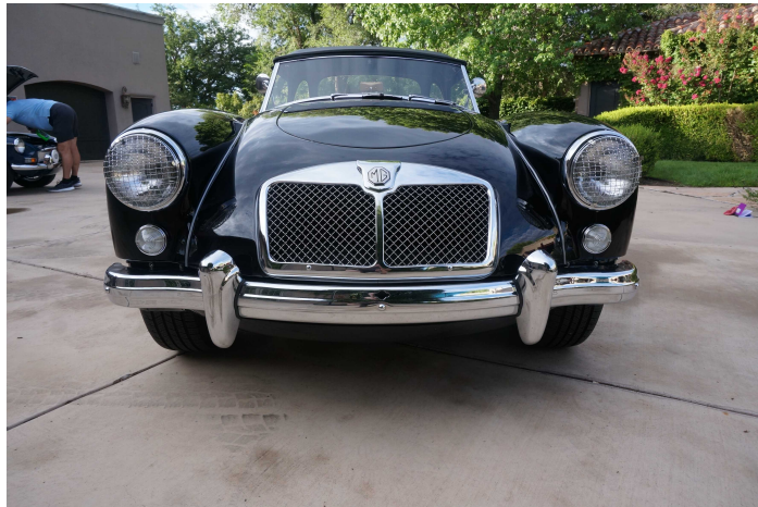
1956 MG MGA